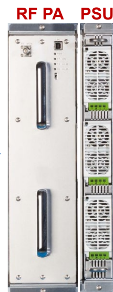
Front View of Modules