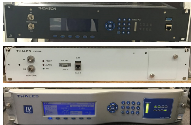
Versions of ADAPT-IV Exciters

Reasonable efforts will be made to maintain parts until the end of support. However, prior to that time, some parts or assemblies may no longer be available for either purchase or repairs.