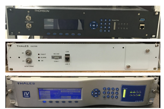
Versions of ADAPT-IV Exciters

Reasonable efforts will be made to maintain parts until the end of support. However, prior to that time, some parts or assemblies may no longer be available for either purchase or repairs.