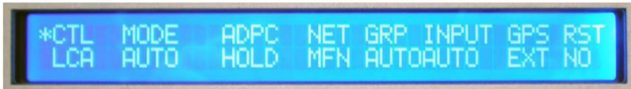
System Control Menu