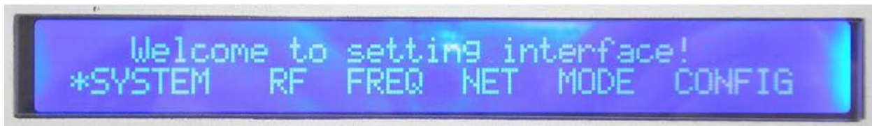
Control Mode Menu

In the menu of both the Comark ATSC8000 and the ATSC5000 DTV exciter, there is a command called "Factory Reset". This command should NOT be used to reboot the exciter. If the exciter should require a reboot, it should be power cycled – factory reset should never be used. A factory reset returns the exciter to its default factory setting, which includes channel frequency and power output. Using the Factory Reset command can damage the transmitter.